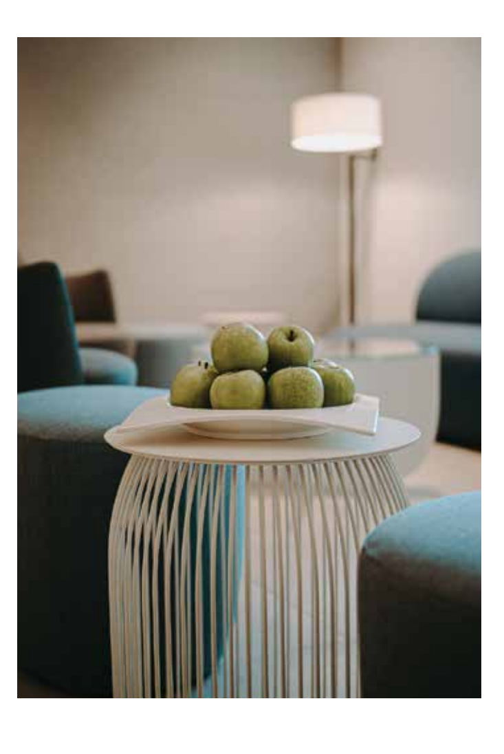
Ground & Lower Floor

Every element of our service and technology is designed to simplify the event planning process, from fast availability checks and transparent pricing to the latest technology tools such as virtual tours and fully interactive floor plans that can be customized to each event.